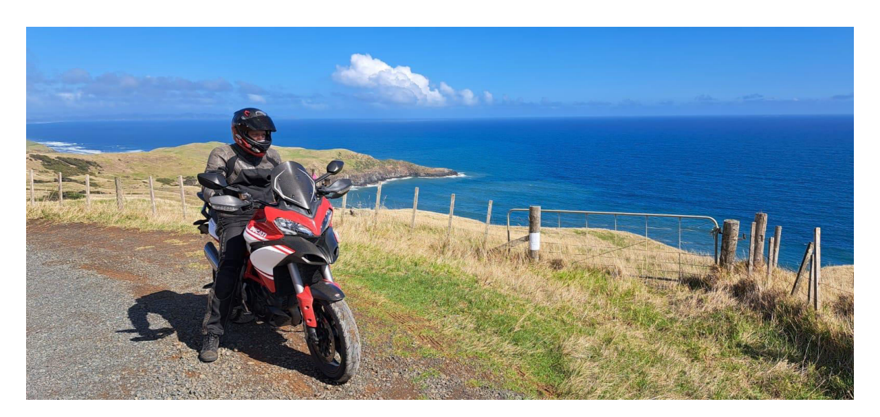
Big Clubroom news- We have a new Beer Fridge! . Plus a new bike to check out See you there this Thursday