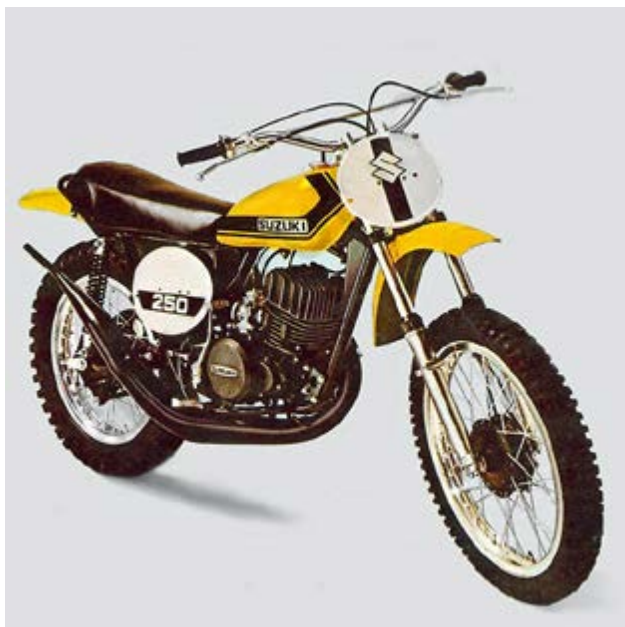
1972 Suzuki TM250

Club member Ron Counsel deserves a mention for his nerve wracking leap over three utility trucks as a special performance for the 8-10,000 spectators present. A 3 foot wide ramp, about 20 ft long, rising to 5 ft high provided his take off point. Flying off at about 40 mph gave a leap of well over 30 ft with his wheels about 90 ft off the ground