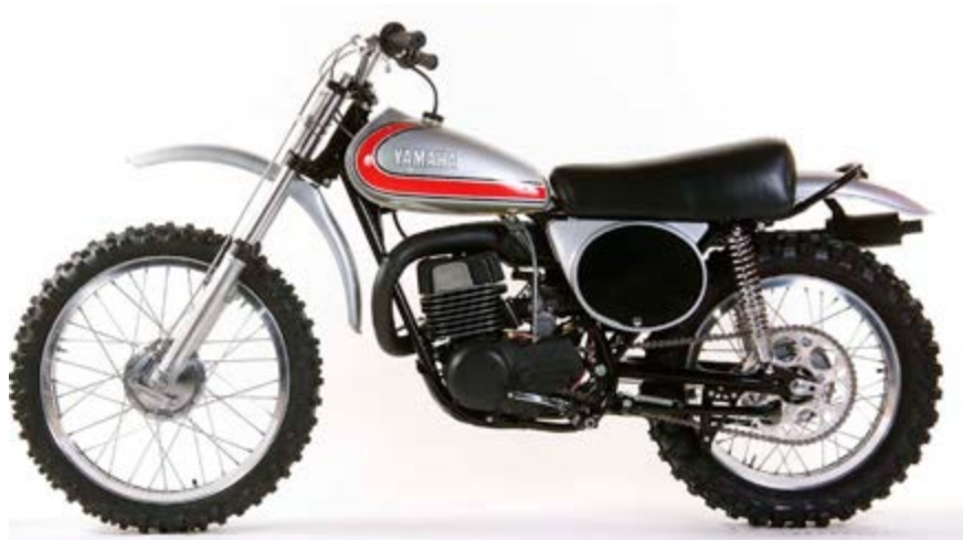
1972 Yamaha DT2 MX

We did this about four times on the night but, the next day the soles of my feet were very tender from the landings!!"