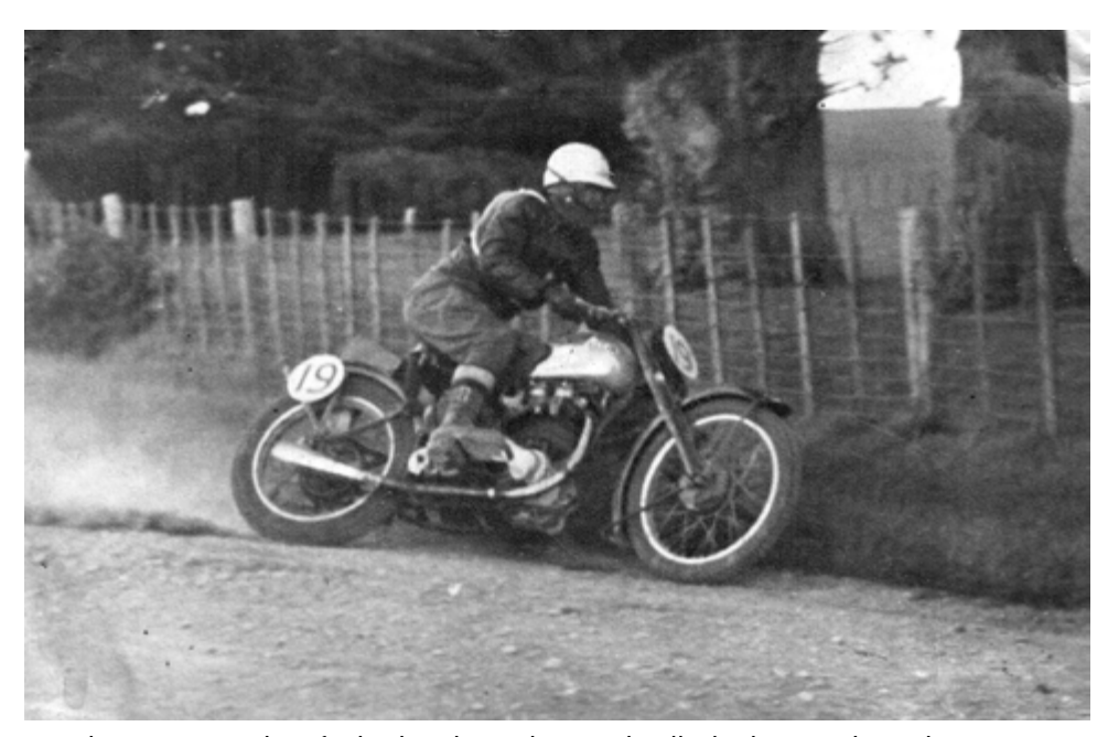
Another as yet unidentified rider, doing the Road Hill Climb, Howden Rd (Gee's Farm)