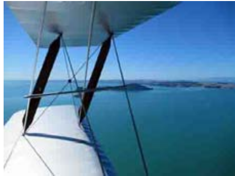
Views from the cockpit of the Tiger Moth coming to our Centenary