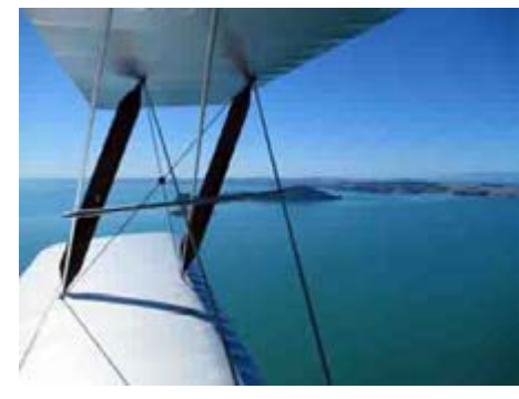
Views from the cockpit of the Tiger Moth coming to our Centenary