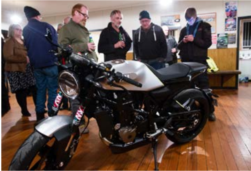
Club members check out the Husqvarna 701 Vitpilen