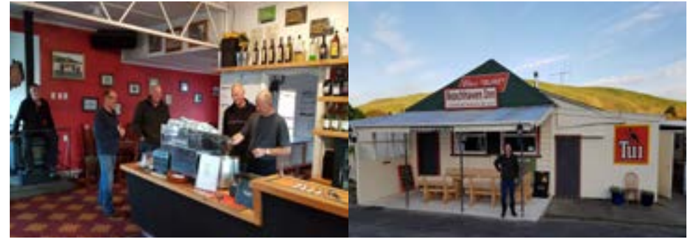
Above: Hebertville, inside & out.