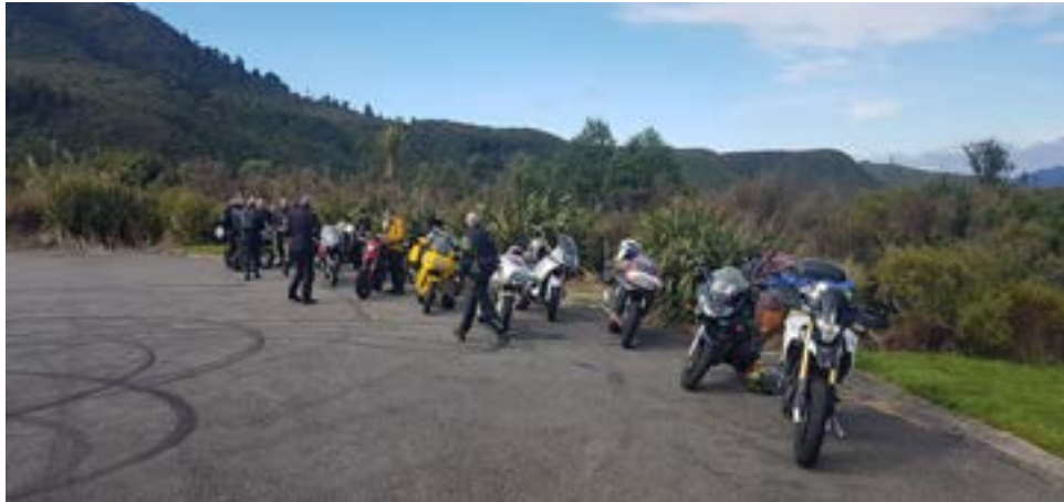
Above: Taupo - Napier pullover