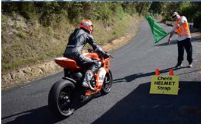
Above: Leeland Bennett (CF Moto 650 - Road)