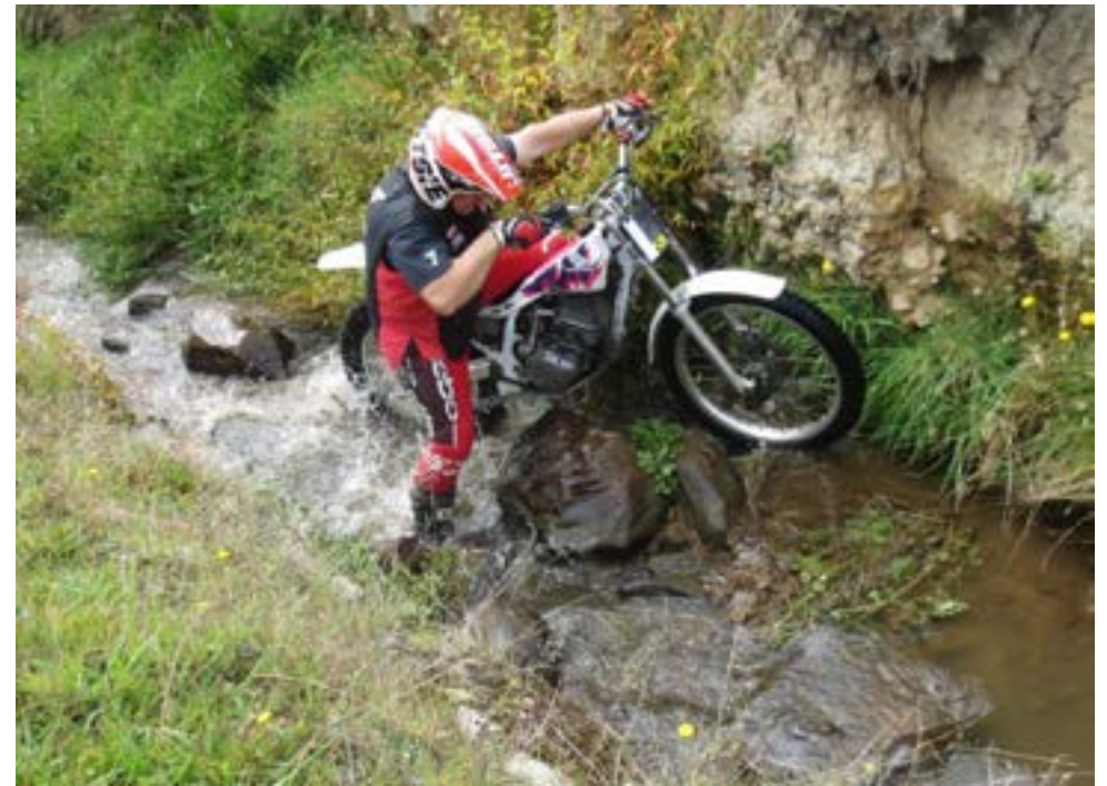
Above: Snowy finds the rocky bit