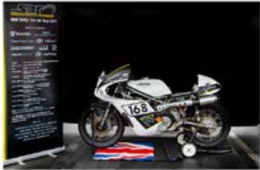
Amongst the display bikes were the TR20 Aprilia fresh back from it's Italian campaign, and the SBR Norton, back from competing in Britain

ON THE Swap Meet side, we have Tim's stable, a bargain barn-find at only $3K, and the world's only four-stroke sporting an expansion chamber