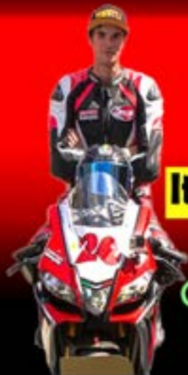
Dillon Telford NZ Superstock 1000 #2