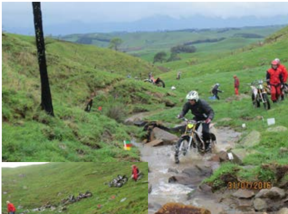
ABOVE: Kevin Gundry makes good progress in the swollen stream. Check out the view.