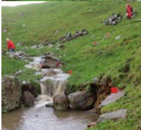
ABOVE: Steve Armistead thinks this is just like the Scottish 6 day, but it will have to drop 10 degrees first!